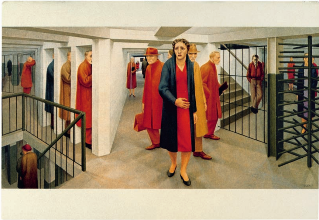
George Tooker: The Subway , 1950. Postcard c. 1980