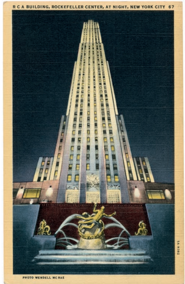
RCA BUILDING, ROCKEFELLER CENTER, AT NIGHT, NEW YORK CITY 67