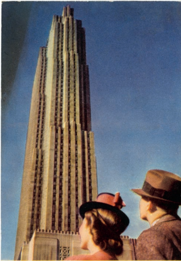
ROCKEFELLER CENTER, N. Y. . . . a "Radio City" skyscraper, 70 stories high, pierces the blue.